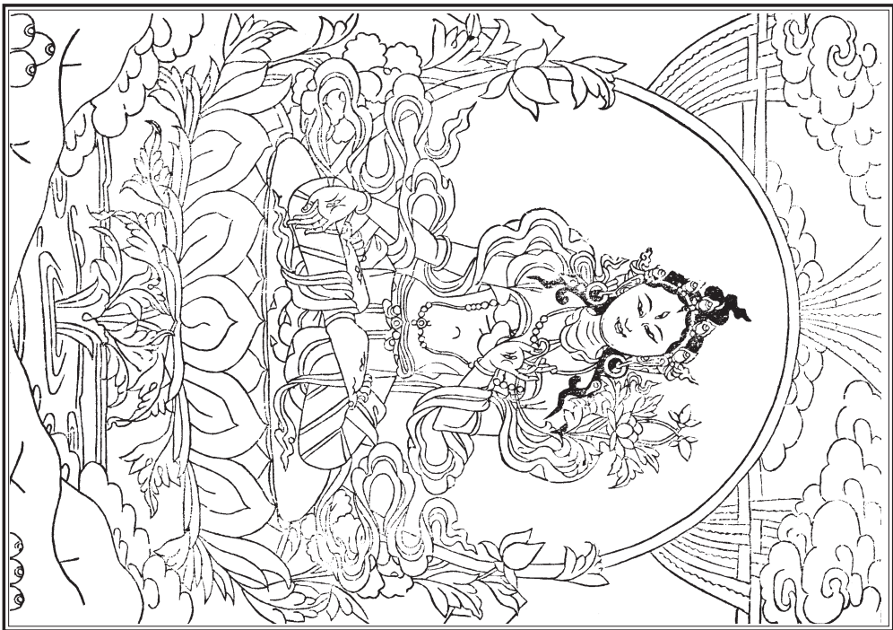
White Tara Artist unknown