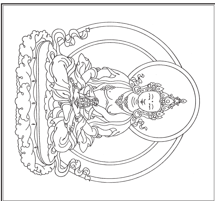
Infinite Light Buddha, Amitayus Artist unknown